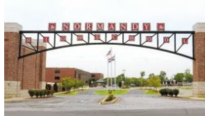
Normandy High School.