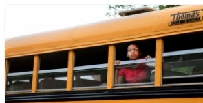
Missouri student transfers: An interactive timeline